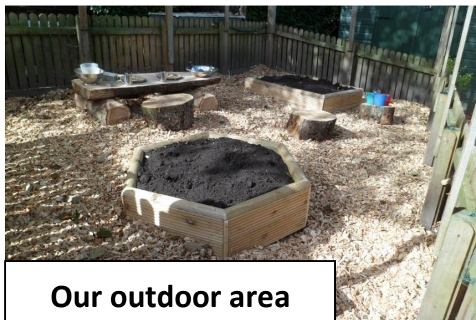
Our outdoor area

If you have reason for complaint, please see the Head Teacher. We have a complaints procedure that we follow and you can receive a copy of this on request.