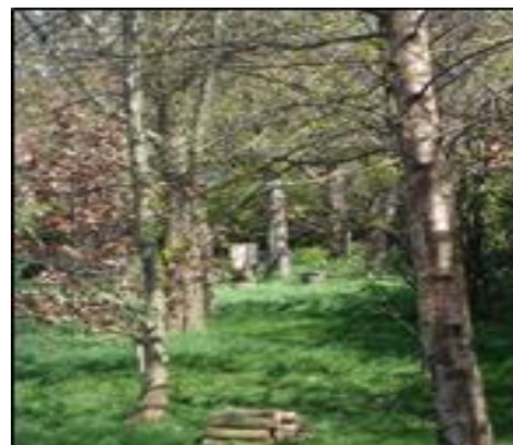
Forest School woodland

We pride ourselves on providing the very best quality of care and education for our children, and by doing this we are always changing and enhancing our Nursery in response to the children's interests.